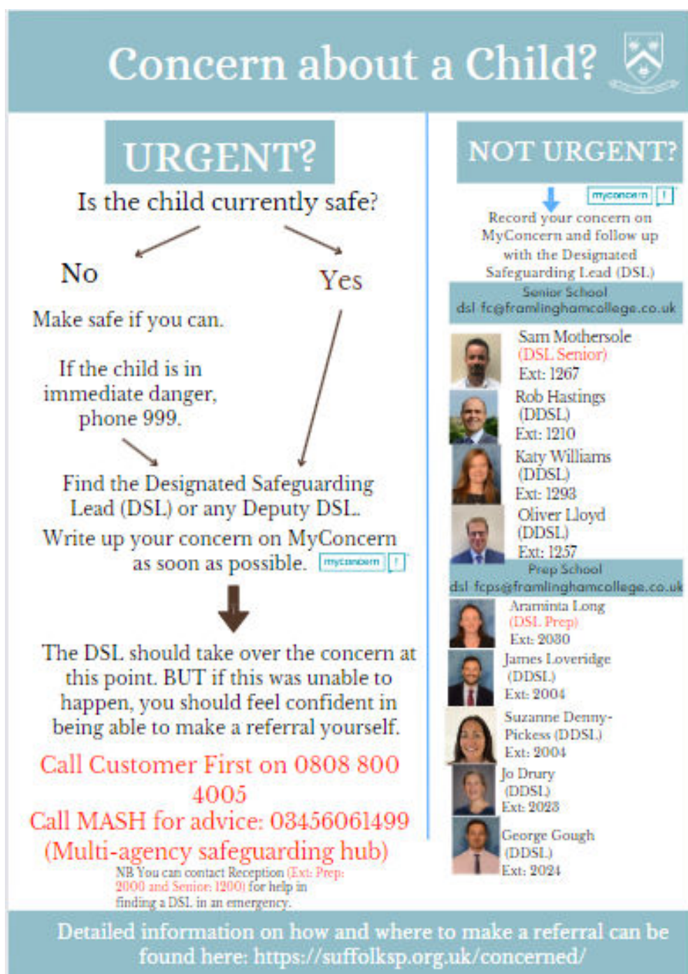
Figure 1: procedure if you have concerns about a child's welfare (no immediate danger)