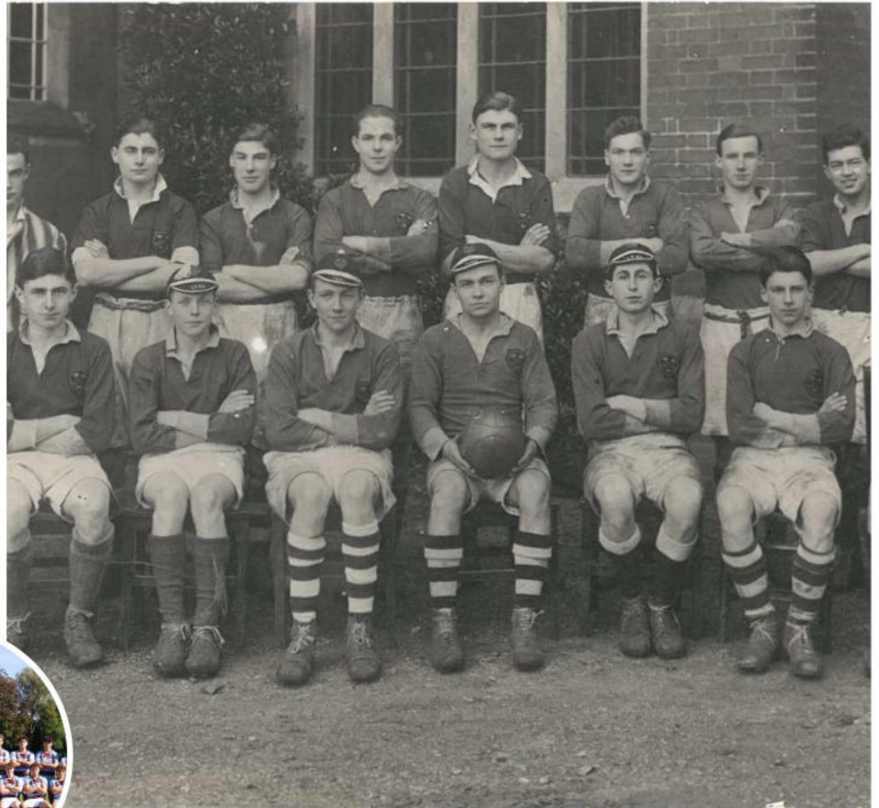
The first XV team in 1924

He continued: “It’s a great commitment for