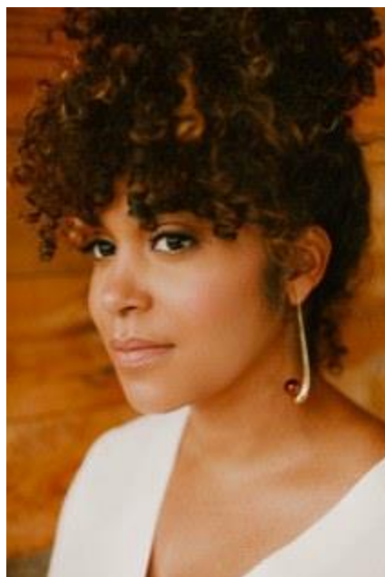
1 - Elizabeth Acevedo